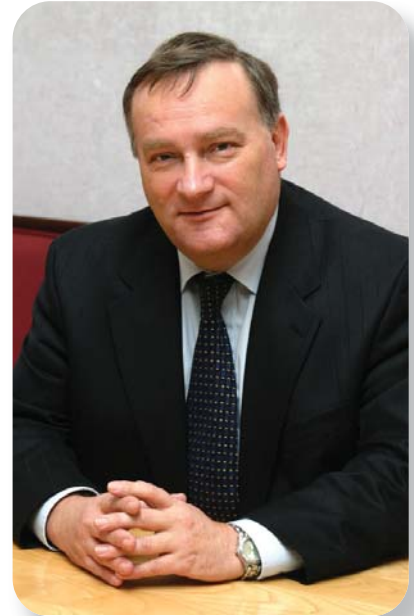
Nick Brown, Minister for the North East